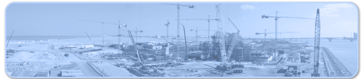
Daily Auto-generated Panoramas