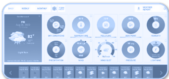
Current and Historical Weather Data