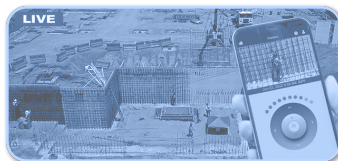
iOS and Android App