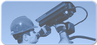
Installation and Maintenance