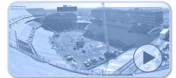
AI-Edited Time-Lapse Videos