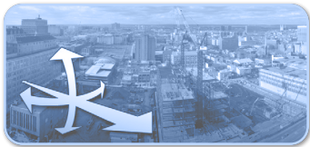
Live Video 360° User Controllable