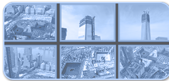
Multiple Preset Archiving