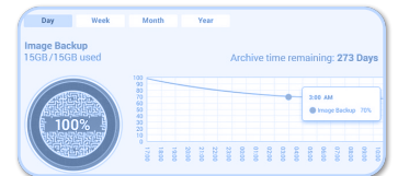
Fail Safe On-Board Backup Storage