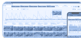
AI Media Dashboard