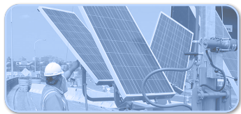
Installation and Maintenance