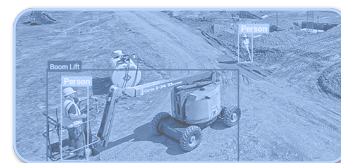
AI Object Detection