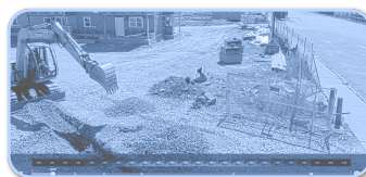
Continuous Video Recording