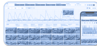
AI Media Dashboard