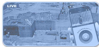
iOS and Android App