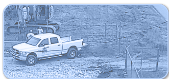
Live Streaming Video

Specification includes camera system and managed services