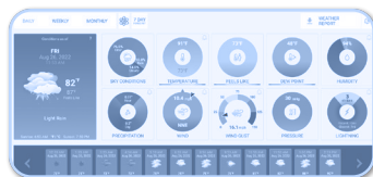
Current and Historical Weather Data